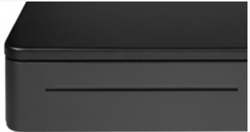
FRONT SLOT FOR BILL ENTRY