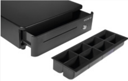
REMOVABLE COIN HOLDER